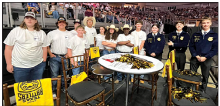
FFA receives donation at annual PBR live bull riding event this fall through fundraising efforts.